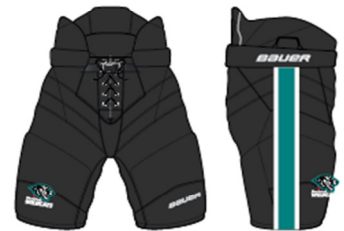
Custom Nexus Pant Cover Shell Senior Senior Pant Shell Design 151551